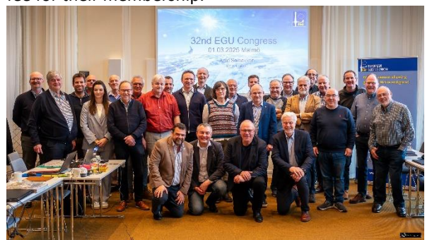
Delegates at the EGU Congress in Malmö

of EGU, it was possible to reduce annual fees as a onetime measure for Full Members by 30%. Our support to Ukraine continues also in this year with no fee for their membership.