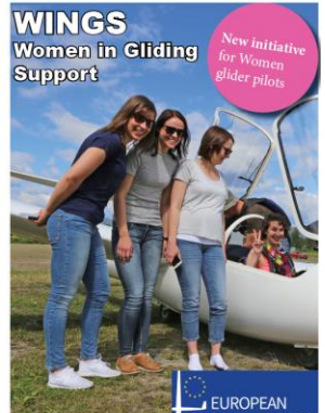
Why Support WINGS?

opportunities they need to succeed. Boost diversity in aviation – A stronger, more inclusive gliding communit benefits the entire sport.